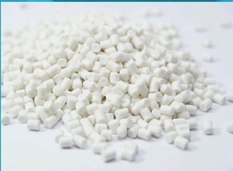
Hydrocerol Chemical Foaming Agents are supplied as concentrates